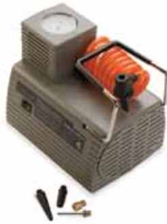
B. 120V Electric Inflator IPS