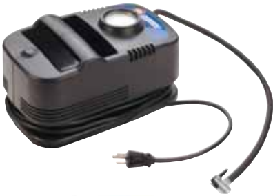
A. Heavy Duty School Inflator IPC