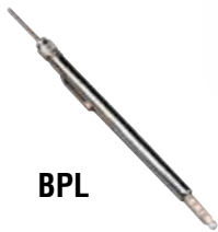
H. Pressure Gauges