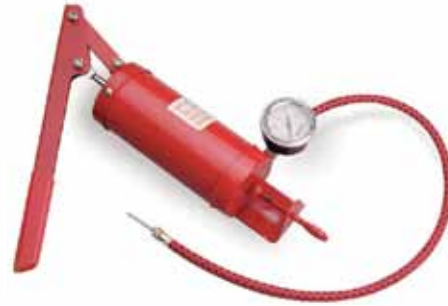
C. Bench/Table Top Pump IPB