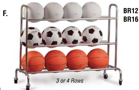
3 or 4 Rows