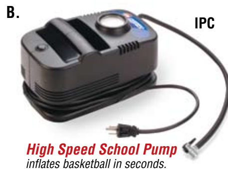
High Speed School Pump inflates basketball in seconds.