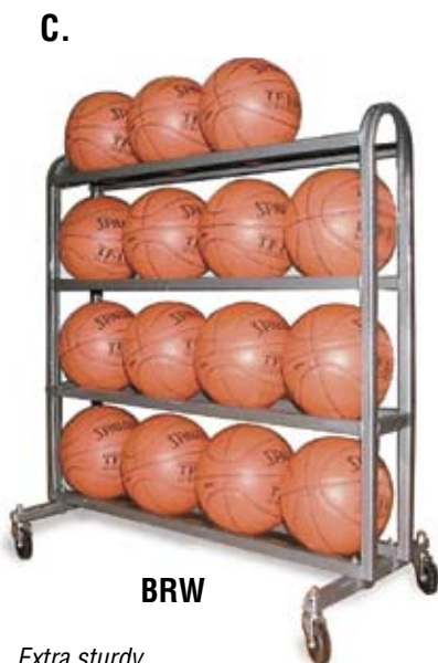
Extra sturdy, all welded construction