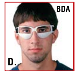
"Heads-Up" Training Glasses