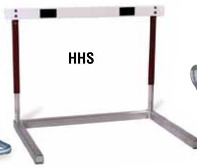
K. Elite High School Hurdle