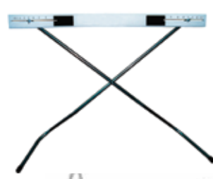
D. X-Training Hurdle HXT