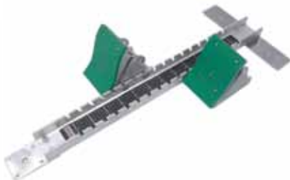
B. Accelerator Starting Block SBC