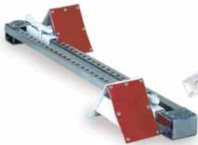
A. All Surface Starting Block w/push-down latch SBAS