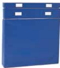
F. Foam Training Hurdle HFT