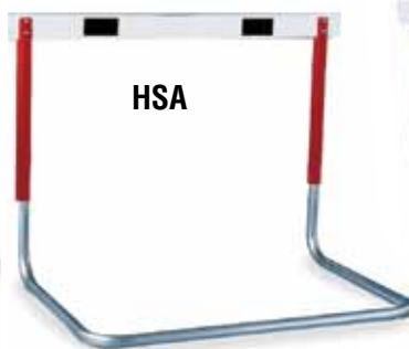
J. Steel/Aluminum Rocker Hurdle