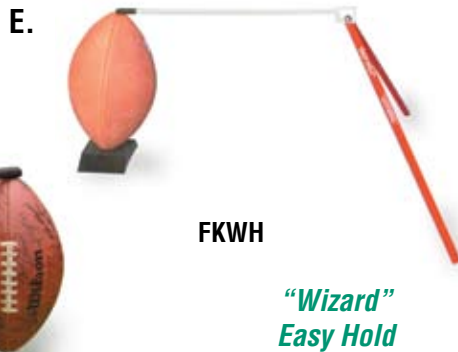
FKWH "Wizard" Easy Hold