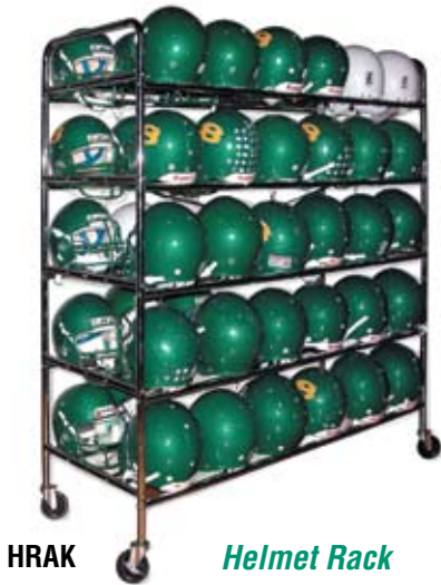
HRAK Helmet Rack