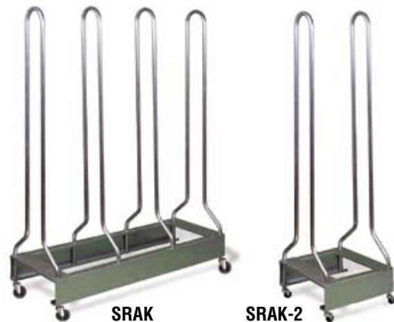
SRAK SRAK-2 Shoulder Pad Racks