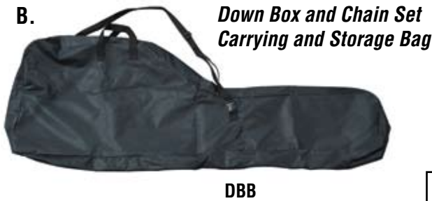
Down Box and Chain Set Carrying and Storage Bag