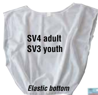
SV4 adult SV3 youth