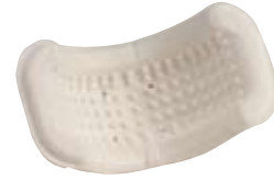
“Pro” & “Protection Plus” foam cup

Non-restricting extra soft convoluted white foam cup holds tight to the chin. Padding covers all plastic edges.